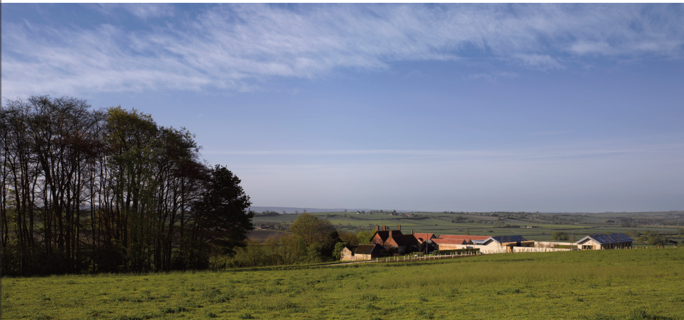
The archive building set beside the existing Windmill Hill farmhouse